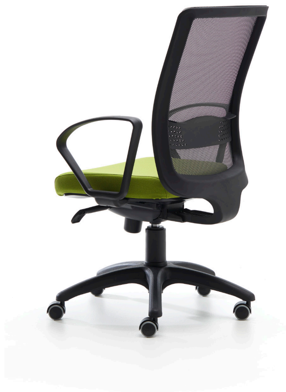
13RETE BURSA RETE EVO ADVANCED SWIVEL CHAIR