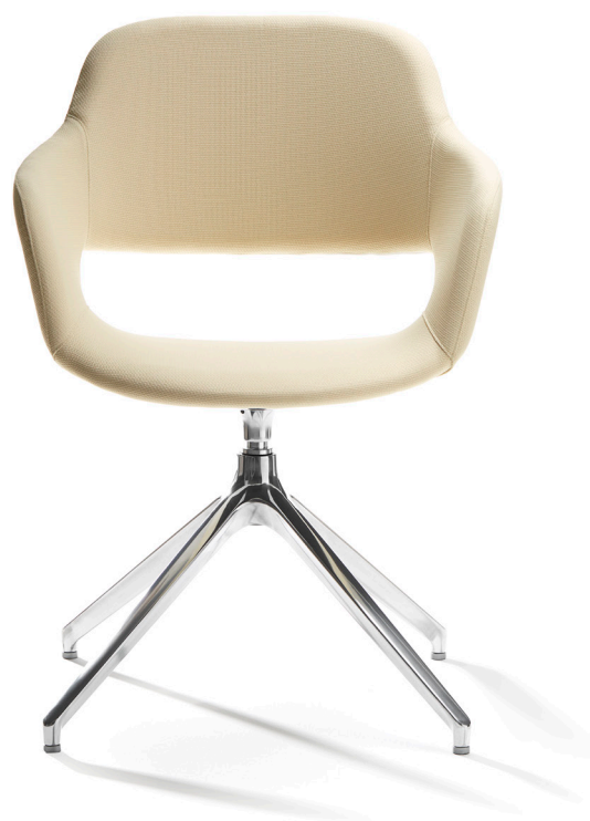
13BL10 WIZARD TUB CHAIR