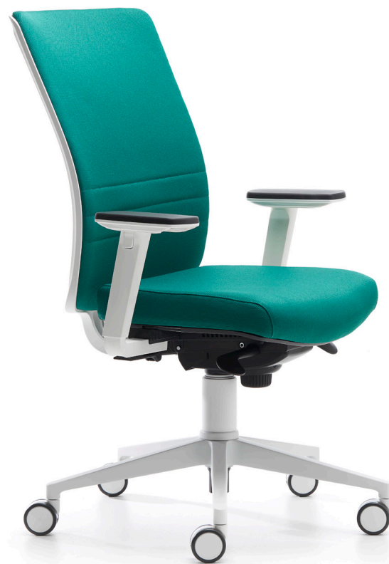
13BB35 BURSA RETE EVO ADVANCED SWIVEL CHAIR