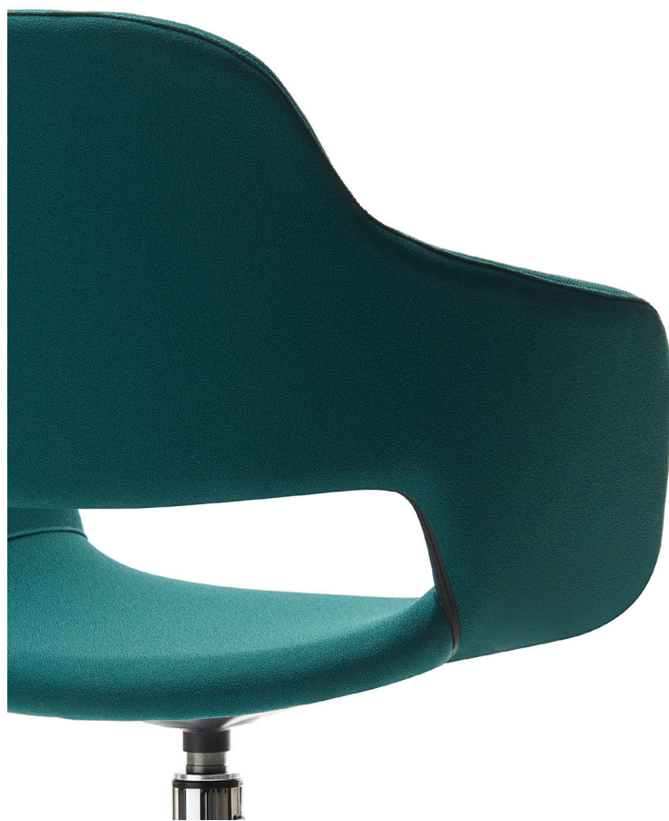
13BB35 WIZARD TUB CHAIR