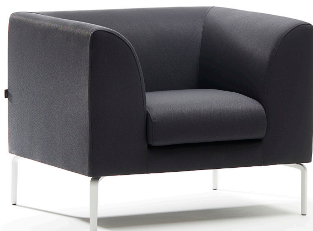
13AR52 ALIAS SOFT SEATING